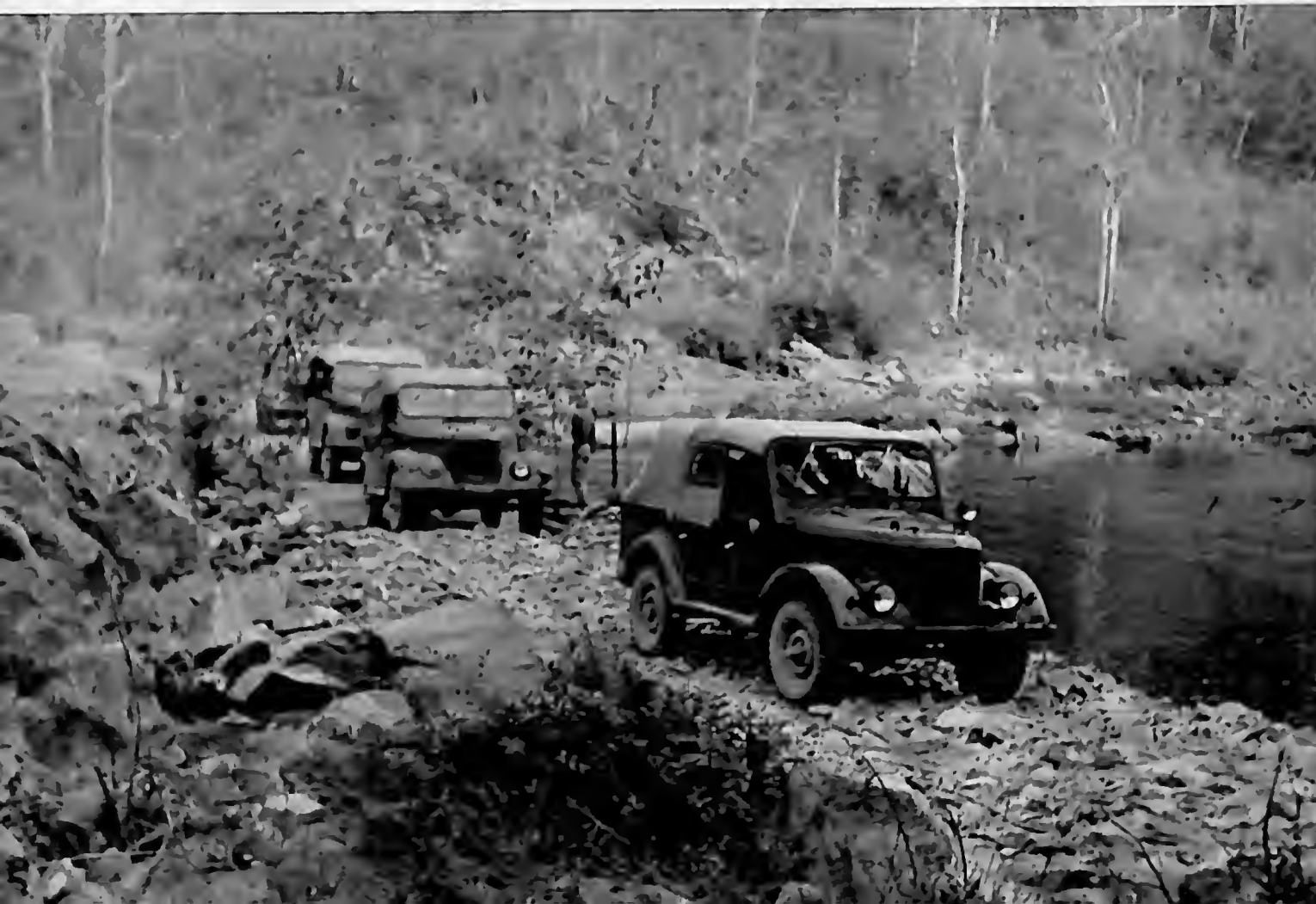
Heading for the Liberated Zone of Cambodia over the famous Ho Chi Minh Trail.